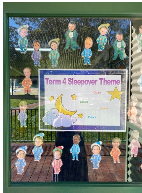
Our 'Sleepover' classroom theme display!